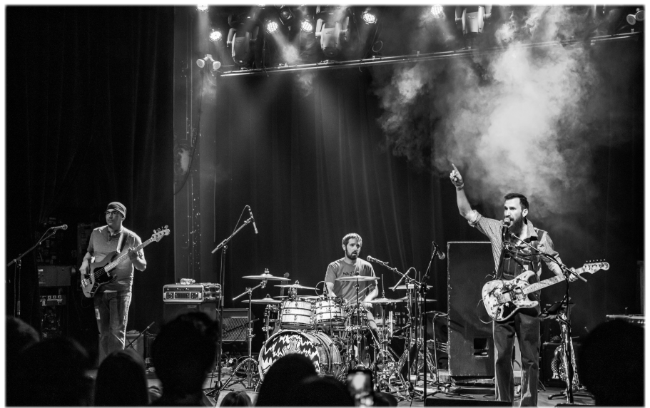
Above: Live 01/02/2020 Sold Out Bluebird Theater